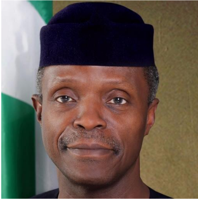
Prof. Yemi Osinbajo, SAN, Vice-President, Federal Republic of Nigeria

Professor Oluyemi Oluleke Osinbajo, SAN, GCON is the Vice President of the Federal Republic of Nigeria. Born on March 8 1957 at Creek Hospital, Lagos, Yemi is a professor of law and a Senior Advocate of Nigeria.