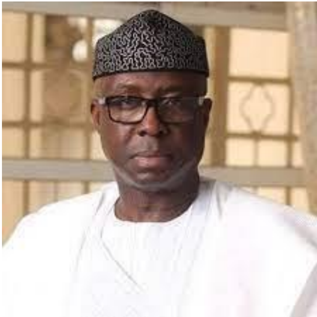
Otunba Richard Adeniyi Adebayo, CON Hon. Minister of Industry, Trade and Investment, Federal Republic of Nigeria

Otunba Richard Adeniyi Adebayo, CON, is Nigeria's 40th Minister of Industry, Trade and Investment and has overseen the government's goal of economic diversification to non-oil revenue earnings. As the number one investment driver of Nigeria, Adebayo is leading the promotion of government's policies of Ease of Doing Business, job creation, poverty eradication and industrialization. The Hon. Minister has been implementing certain policies and programmes including: standardization of bilateral trade agreements, stimulating growth of domestic Micro, Small and Medium Enterprises, MSMEs and renewed roadmap to increase Nigeria's Foreign Direct Investment, FDIs.