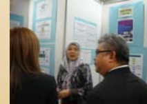
Exhibition during Customers' Day Dec 2008