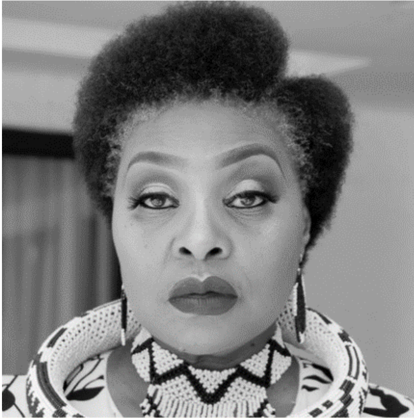
Yvonne Chaka Chaka Artist and Vice-President, CISAC, South Africa

Yvonne Chaka Chaka has been at the forefront of South African popular music since 1985, becoming known as the “Princess of Africa”. Having shared the stage with creators including Angélique Kidjo, Annie Lennox, Bono, Queen, Miriam Makeba and Youssou N’Dour, Yvonne Chaka Chaka has also performed for Queen Elizabeth II, US President Bill Clinton, South African President Thabo Mbeki and a host of other world leaders.