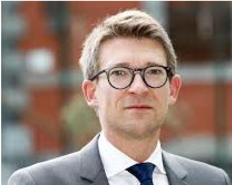
Pierre-Yves Dermagne Minister of Economy and Employment, Belgium

Pierre-Yves Dermagne holds a Law degree from the Catholic University of Louvain and has been Deputy Prime Minister and Minister of the Economy and Labor since October 1, 2020 and Mayor of Rochefort since December 3, 2018 (in title since September 13, 2019).