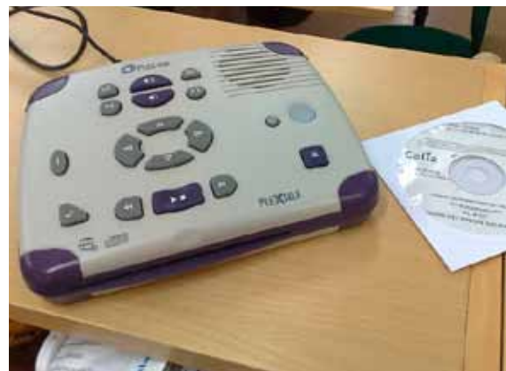
DAISY PLAYER AND AUDIO BOOK AT HELSINKI CITY LIBRARY

Accessible format copy Article 2(b) describes an “accessible format copy” as a copy of a work in a form which gives a beneficiary person “access as feasibly and comfortably as a person without visual impairment or other print disability.”