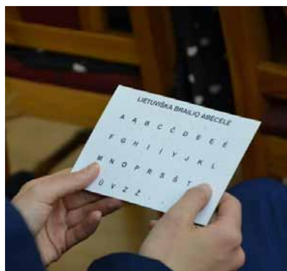
LITHUANIAN BRAILLE ALPHABET

The more uses that are permitted under the limitations and exceptions, the more comfort will be provided to those making and distributing accessible formats: in essence, empowering those providing access to persons with print disabilities. This is particularly important because a condition of receiving an accessible format copy across a national border (importing) is that the law of the receiving country must permit the production of that format under an exception. 30 Therefore the more types of accessible formats allowed under national law, the more legal certainty there is for a country importing accessible format copies made in another country.