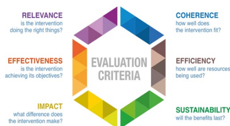
Figure 1 - only available in English