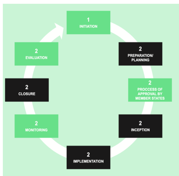
Figure 1 – DA Project Life Cycle Flow Chart (only available in English)