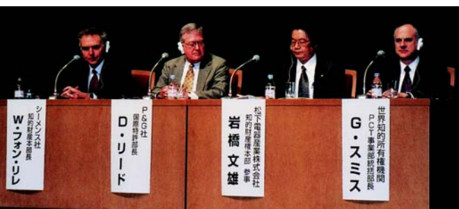
Panel discussions at the seminar

Appreciation of the PCT system has grown significantly in Japan in the last few years, and Japanese applicants are now the third largest users of the PCT.